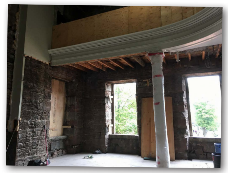
The Chamber with finishes removed to expose interior walls and structures