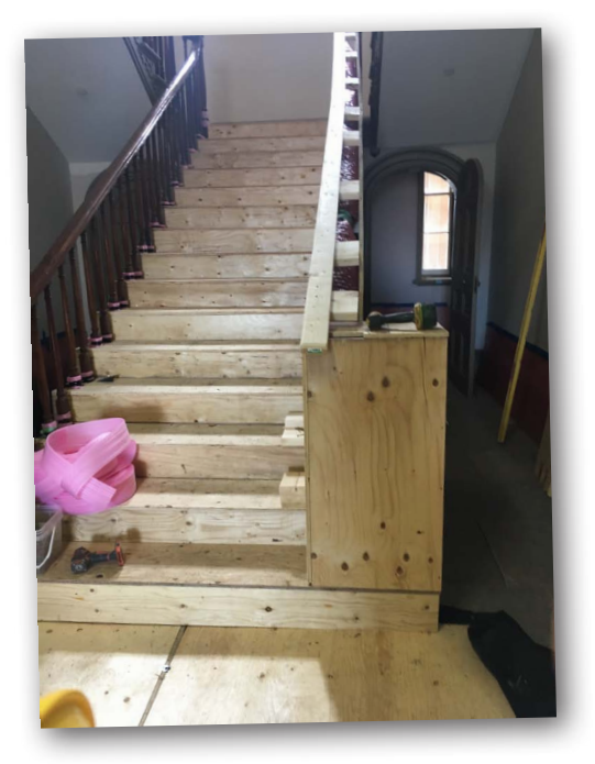
Main staircase from the ground floor