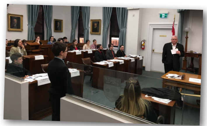
Speaker Watts welcoming participants of the French youth parliament to the Chamber

The Honourable Francis (Buck) Watts, Speaker of the Legislative Assembly of Prince Edward Island was very pleased to welcome over 40 Francophone youth to the Chamber from all Atlantic provinces for the "Parlement jeunesse de l'Acadie" from January 6-9, 2017. The event is held every two years, rotating between the four Atlantic Provinces. Topics debated were of current concern and chosen by the participants.