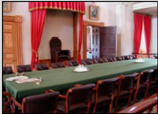
Present day photo of the Legislative Council Chamber restored to 1864 period.

The Chief Justice acted as president of the Legislative Council, but early reforms in 1838 excluded the Chief and the Bishop of Nova Scotia from membership in either Council.