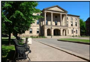
The main doors of Province House face down Great George Street toward Charlottetown Harbour.

As part of the agreement, Parks Canada undertook a major restoration of Province House, completed in 1983 and costing about $3.5 million dollars.