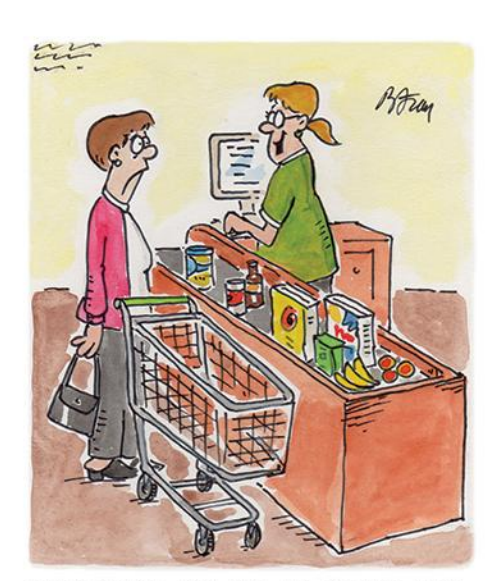
"HOW WOULD YOU LIKE TO PAY FOR YOUR PURCHASE TODAY-CASH, CREDIT OR PERSONAL INFORMATION?"

We have not come up with a good name for our inaugural newsletter. Please let us know if you have a good idea. We have no prizes to give, except our gratitude. Our contact information is at the bottom of page 2.